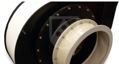
Polystone® P Flex